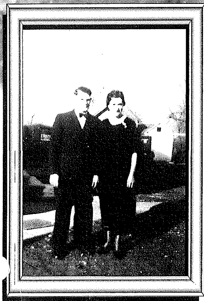
Wedding Day Nov. 8, 1932